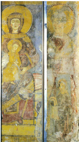
Figure 4. Virgin and Child with St. Clement and a female donor , Baptistery of Old S. Clemente, Rome.

Source: Wikipedia http://upload.wikimedia.org/wikipedia/commons/b/b5/Rubin2.jpg (particolare).